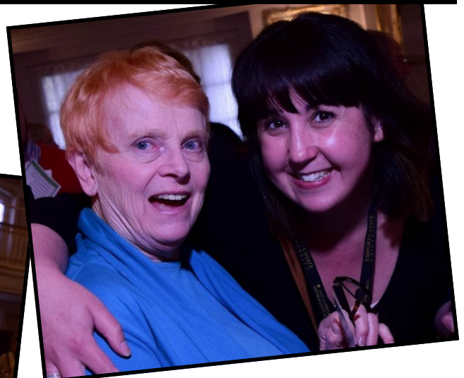
at WLA's First-Timer/ New Member Reception sponsored by WALE, 2016